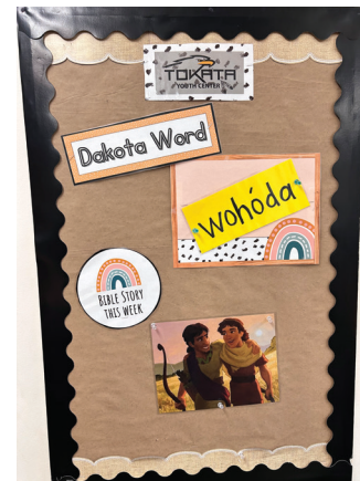
Dakota Word for Respect