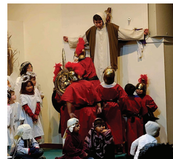
Christmas Program “From the Manager to the Cross”