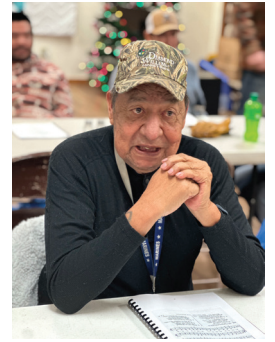
Little Christmas Fellowship and Hymn Singing