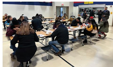
Tribal Housing Meeting

As it turns out, the TYC is far exceeding our expectations as a resource to strengthen the community! Rod often jokes, “We should not have put light switches in the new TYC building; just keep the lights on all the time since the building is always full of people!”