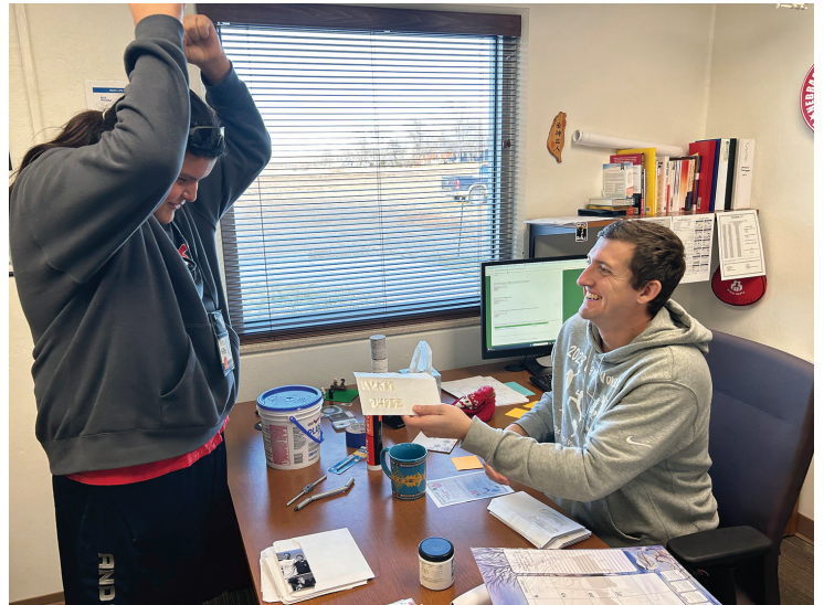
Youth Mentor Receives First Paycheck.

The incredible work being done with over 420 youth enrolled at the Tokata Youth Center is made possible by the invaluable contributions of our Youth Mentors . At any given time, our team includes between 6 and 8 Teen Mentors—older teens and young adults who have grown up attending the TYC and now serve as part-time staff. For most of them, this is their first paying job. Not only do they mentor younger youth and learn valuable life and career skills, but they also get to experience the thrill of receiving their first paycheck —a significant milestone on the path to productive adulthood and the fulfillment of their life goals.