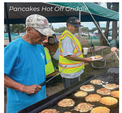
Pancakes Hot Off Griddle