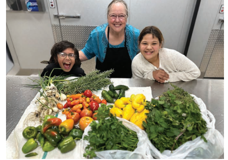
Sharing the Harvest