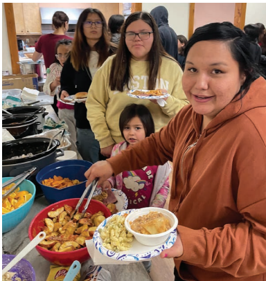
Meal & Fellowship