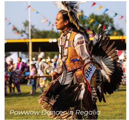
Powwow Dancer in Regalia

There is also a spiritual "meal" on Sunday mornings as powwow weekend is the one Sunday each year we do not worship at the Ikce Oyate Christian Center. Instead, we gather for worship beside the powwow arena , where Dakota language hymns are sung and God's Word is preached. Hearing the old hymns sung outdoors in Dakota is a beautiful sight and sound, a powerful witness, and a meaningful part of the powwow tradition.