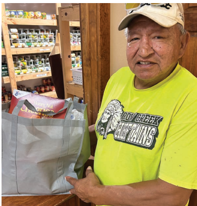
Sharing Food, Sharing Hope

At the Ikce Oyate Christian Center, this happens in several ways: our food pantry, the meals shared before worship and during Bible study, a monthly potluck after worship, and other special gatherings throughout the year. In 2024, the pantry served 720 households (2,107 individuals), and more than 2,000 meals were shared at DWM gatherings, each one an opportunity to meet needs, build relationships, and share the hope of Christ. By mid-2025, we have already served 463 households (1,299 individuals). We praise God for continued opportunities to share the love of Jesus.