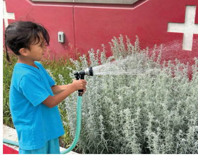
Watering Grandma Garden