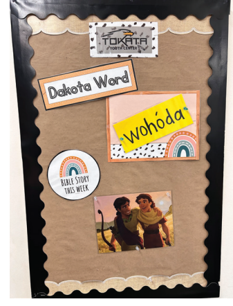
Dakota Word for Respect